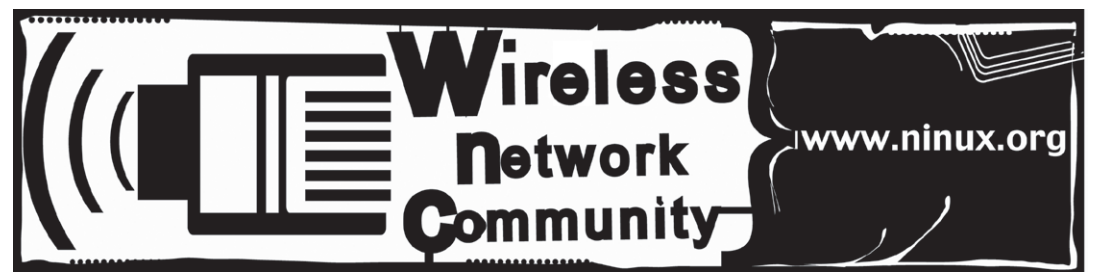
The sticker promoting the early ninux community network.

list and meetings. The motivations for joining the community ranged from socio-political reasons, to helping to bridge the digital divide, a desire to learn by doing, down to pure curiosity.